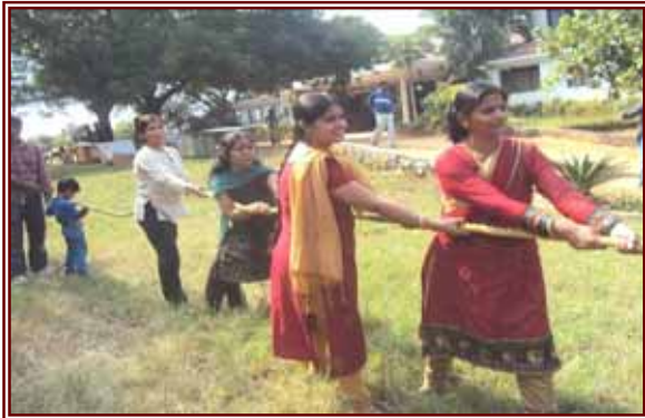
Tug of war - Women