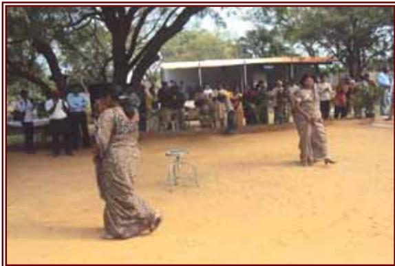
Chairperson in finals - Musical chairs