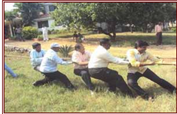
Tug of war – Men