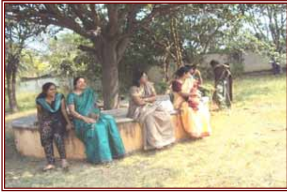
Audience for the game